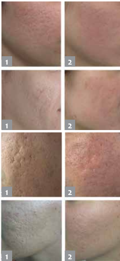
FIGURE 2: Patients before the combination treatment with PCI and FRM (1) and 60 days after the treatment (2)

We suggest the evaluation of the protocol here established in other groups to confirm the results and conclusions here presented. ●