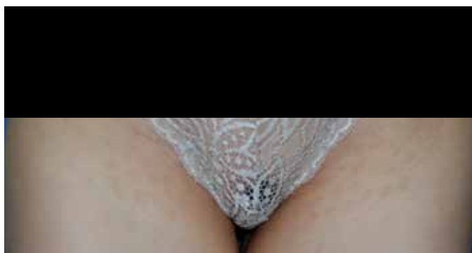
FIGURE 3: Após uma sessão de indução percutânea de colágeno

The effect of microneedling used alone in the treatment of skin hyperpigmentation can be a promising therapy, although there is need for further studies to help clarify the mechanism of action and maybe even establish better treatment protocols to enhance the technique's therapeutic effects. ●