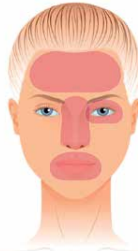
FIGURE 2: Facial site where poly-L-lactic acid should not be applied

performed with a cannula in the superficial subcutaneous plane, anteriorly to the parotid gland and to the masseter muscle, using the fan retroinjection technique. 16 Application in appropriate anatomical regions of the lower third of the face restores the contour of the chin and mandible, which undergo remodeling during aging. The irregularities of the lower face's contour can be treated by supraperiosteal bolus applications (0.1 to 0.3 ml / cm 2 ) along the chin's border aimed at promoting the increase of its anterior projection; in the region lateral to the mentum ( prejowl sulcus ) and along the jaw's body and angle, aimed at restoring the mandible support and redefine the facial contour. For the treatment of flaccidity in the lateral region of the face, resulting from dermal atrophy due to degeneration of collagen and elastic fibers, it is recommended to apply poly-L-lactic acid using the linear retroinjection technique with a needle in the subdermal plane, with a layout of several parallel beams (0.02 to 0.05 ml / beam). As a result, a traction vector is created by neocollagenesis, contributing to the lifting effect on the lateral region of the face. Applications should not be performed in the perioral region, as this area has hyperdynamic muscles. 39