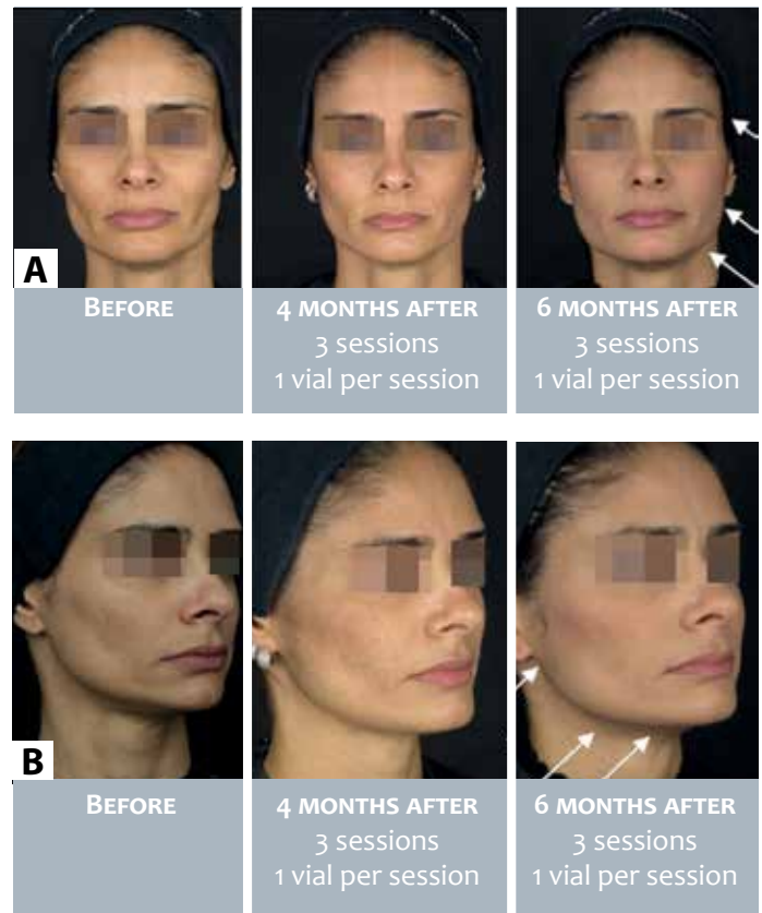
FIGURE 1: Aesthetic results following the application of poly-L-lactic acid. Frontal (A) and oblique (B) views of the patient

The selection of dynamically stable sites of application, with sufficient dermal thickness to allow appropriate depth of injection may assist in obtaining more favorable results. Chart 4 shows a summary of the anatomical location of the applications, while Figure 2 shows the locations where the product should not be applied. In the upper third of the face, poly-L-lactic acid should not be applied into the frontal and periorbital regions, for the musculature is hyperdynamic in these sites. 39 In the temporal fossa, there should be attention with the superficial temporal artery, which is at the level of the temporal fascia. The application in this area should preferably be carried out supraperiosteally – since it is a more secure plane – in 0.3 ml boli. 16 The middle third of the face is a common area of projection and volume loss. The projection of the face is mainly due to the bone support of the maxilla and the zygomatic arch. In aging, the resorption of these bone structures can be corrected with the application of poly-L-lactic acid in the suprape-