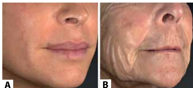
FIGURE 1: Perioral Aging - A: Young lips; B: Aged lips

the projection of the upper lip: 40% of the cases had a 5° decrease in the nasolabial angle, while 60% of cases experienced a 3° decrease.