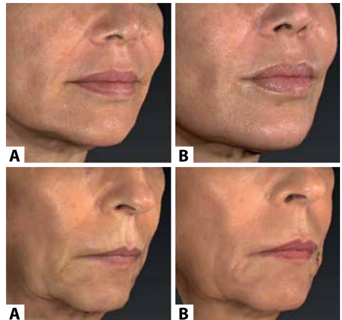
FIGURE 3: A - Before; B - After five laser sessions