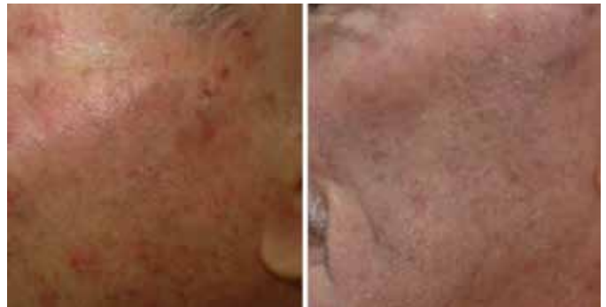
FIGURE 2: Improvement of telangiectasias