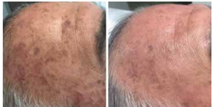
FIGURE 3: Improvement of AKs and pigmentation after two DLPDT sessions