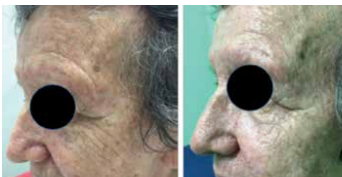
FIGURE 5: Improvement of fine wrinkles

the treatment of multiple AKs, yielded overall rejuvenation in all patients, thus contributing to the increase in satisfaction about the procedure.