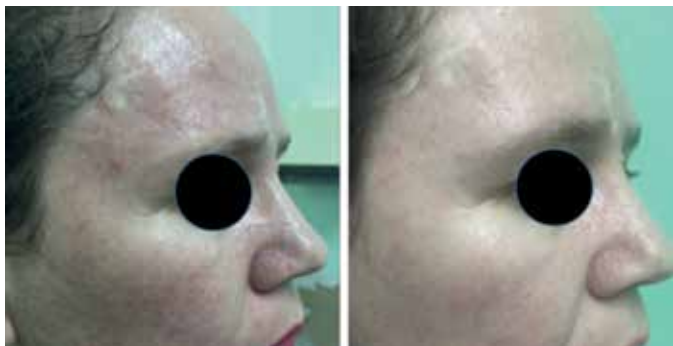
FIGURE 4: Improvement of telangiectasias, roughness and facial erythema