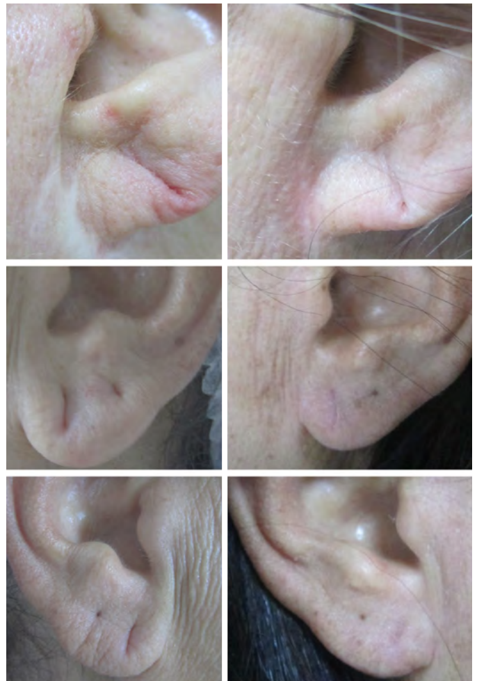
FIGURE 2: Earlobes before and 30 days after treatment with RFPM®

digital camera, under the same environmental conditions, immediately before and 1 month after a single intervention. The study was performed according to the Helsinki Declaration.