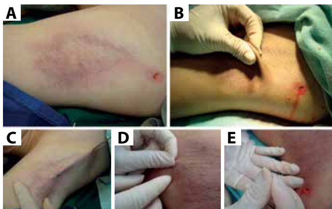
FIGURE 3: Parameters that indicate sufficiency of the curettage: A - Slightly bluish axillary skin; B - The skin becomes very thin and easily pinched; C - The skin is aspirated through the cannula's orifices; D and E - Axillary hair come easily off when lightly pulled by the surgeon

Likewise, in case of recurrence (insufficient curettage, anatomical variations with great concentrations of sweat glands in the upper reticular dermis, compensatory hyperfunction of the remaining sweat glands, curettage performed in the wrong anatomical layer), curettage can be repeated with effective results, without causing an increase in the occurrence of serious complications. 41