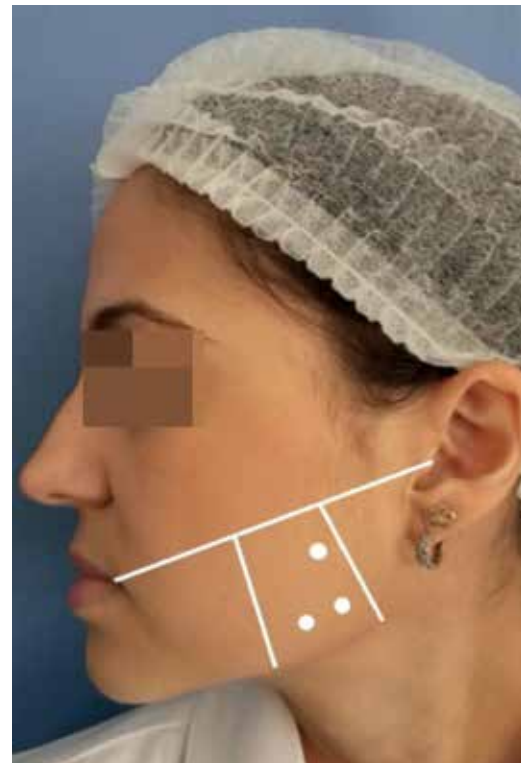
FIGURE 2: BoNTA application points

Moreover, the authors suggest that successive doses at