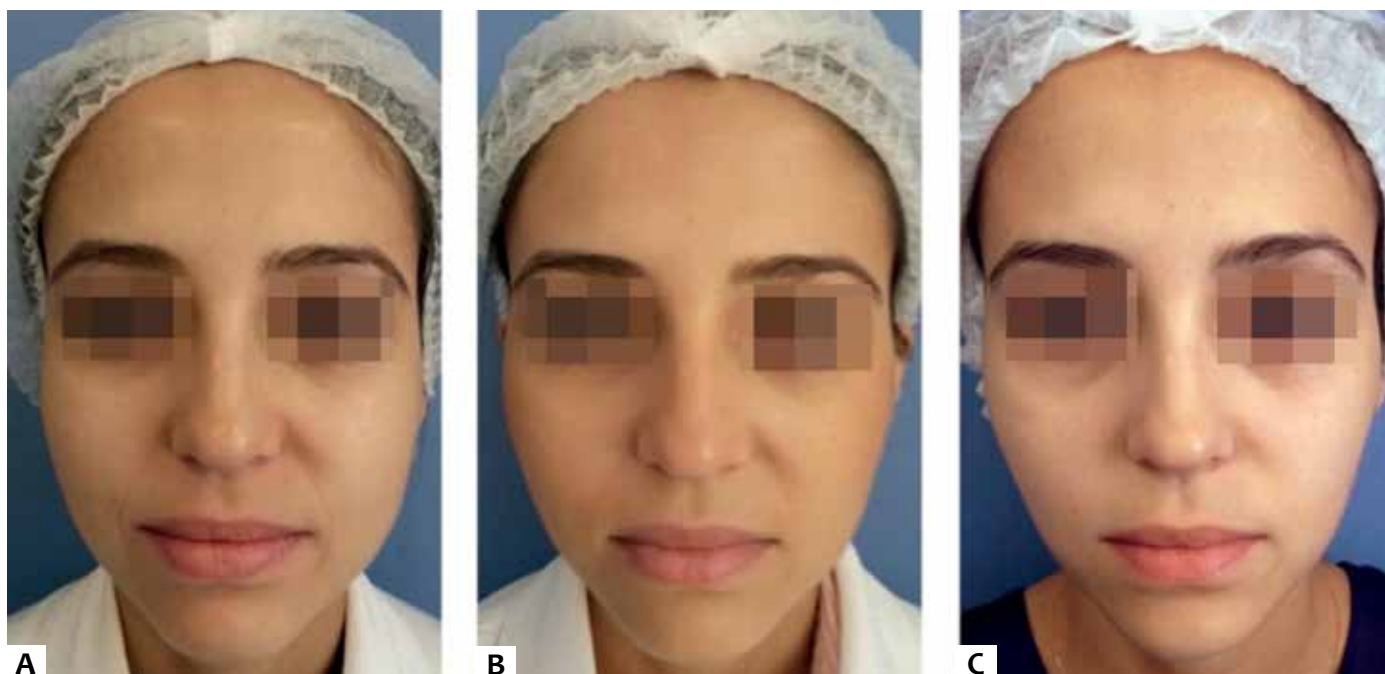
FIGURE 3: (a) Pre-treatment. (b) Three months after the application. (c) Six months after, with the thinning of the lower third

The application of BoNTA has proven to be a straight-