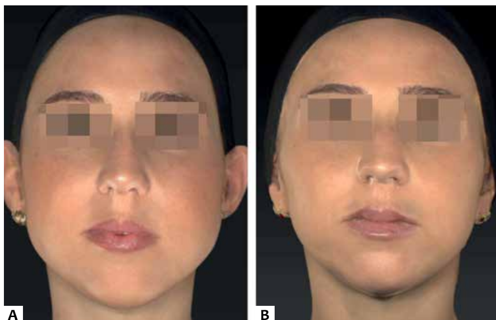
FIGURE 4: (a) Pre-treatment. (b) Six months after the application