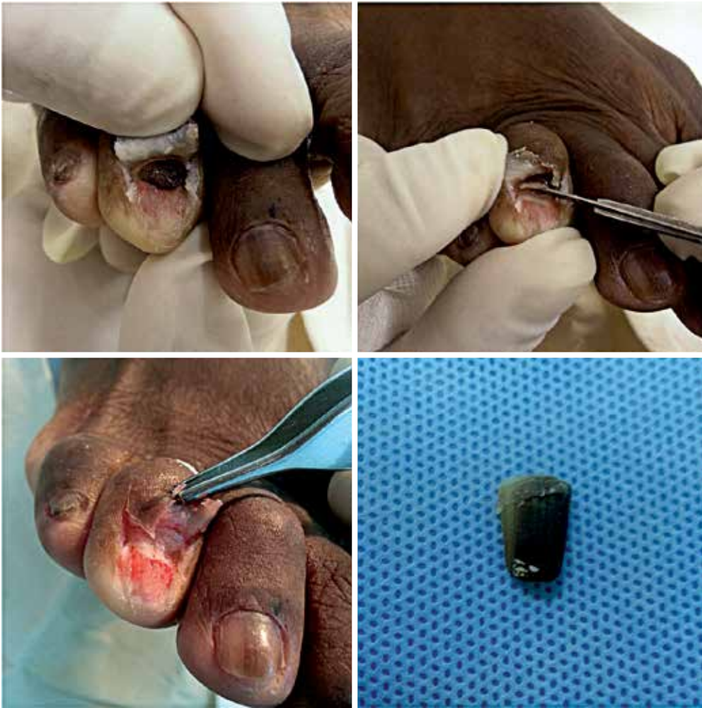
FIGURE 3: Avulsion of the nail plate showing a pigmented nodular lesion in the nail matrix region