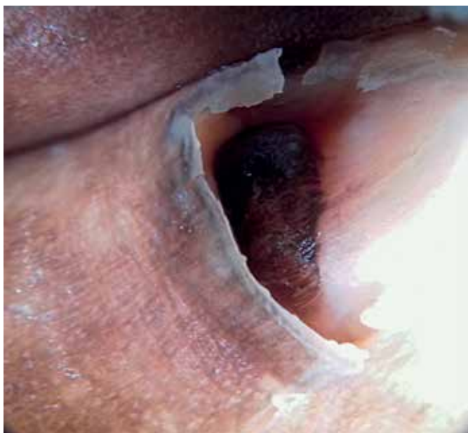
FIGURE 4: Intraoperative dermoscopy: blackened lesion with gray areas simulating blue-whitish veil and microinvasion signs in the distal third of the lesion

trix region revealed multiple colors with irregular longitudinal lines, favoring the initial hypothesis of nodular melanoma. The lesion was then complete excised with 1mm deep shaving.