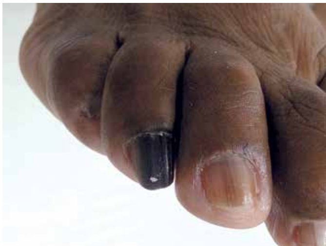
FIGURE 1 : Longitudinal melanonychia in the fourth toes of the right foot

The pathological examination evidenced a fibrous proliferation in the dermis with hyperpigmentation of the basal layer, compatible with pigmented fibroma, leading to the exclusion of the hypothesis of melanocytic origin for the lesion (Figure 5).