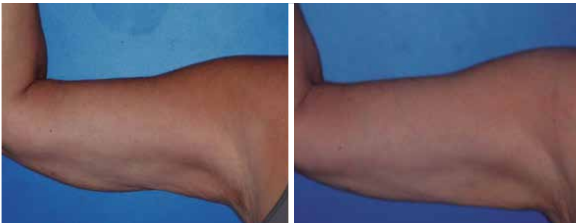
FIGURE 3: Before and after eight RF sessions