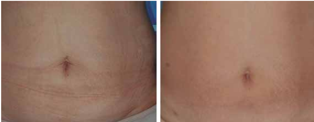
FIGURA 6: Photographs demonstrating the association of RF in the pre-laserlipolysis (before and after eight RF sessions).

also showed action in the treatment of body contours and cellulite.