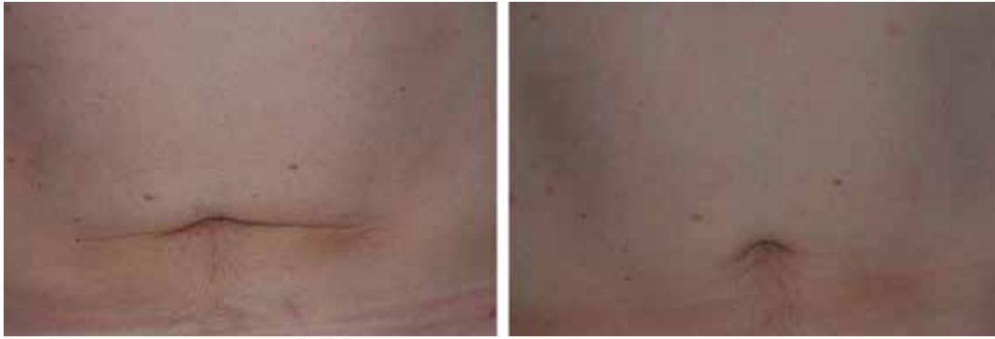
FIGURE 5: Photographs demonstrating the association of RF in the pre-laserlipolysis (before and after four RF sessions)