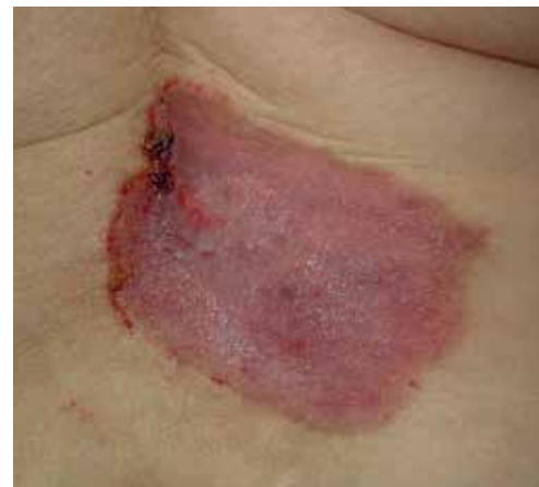
FIGURE 3: Lesion after five weeks of treatment, showing ulceration in the more proximal medial border and the remaining of the lesion with only moderate irritation