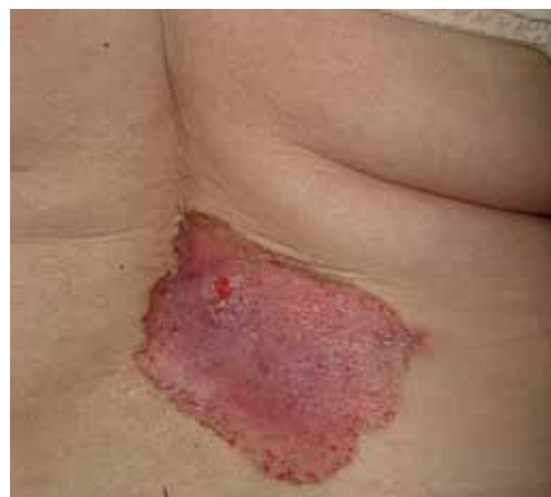
FIGURE 1: Lesion in the shape of an erythematous squamous crusted plaque with well-defined edges, located in the lower back right with dimensions of 12cmx10cm