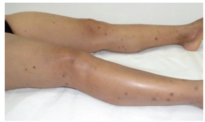
FIGURE 1: Presence of multiple dermatofibromas in LL

Two years after the onset of the systemic picture, the patient sought out the Dermatology Service due to the fact that the lesion presented a significant increase of brownish nodules, then numbering greater than 40, predominantly in the LL, UL, and abdomen (Figures 1 to 3). The biopsy of one of the lesions characterized the presence of dermatofibroma (Figure 4).