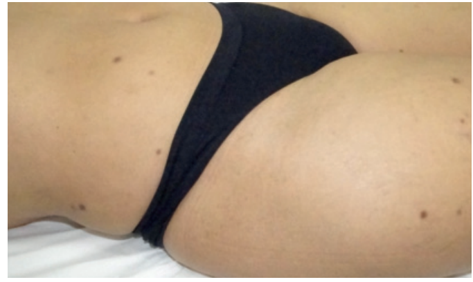
FIGURE 3: Presence of dermatofibromas in LL and abdomen

The patient had FAN 1:1,280 on the occasion, normal protein electrophoresis and echocardiogram, and was taking meloxicam, famotidine and 6mg/day deflazacort.