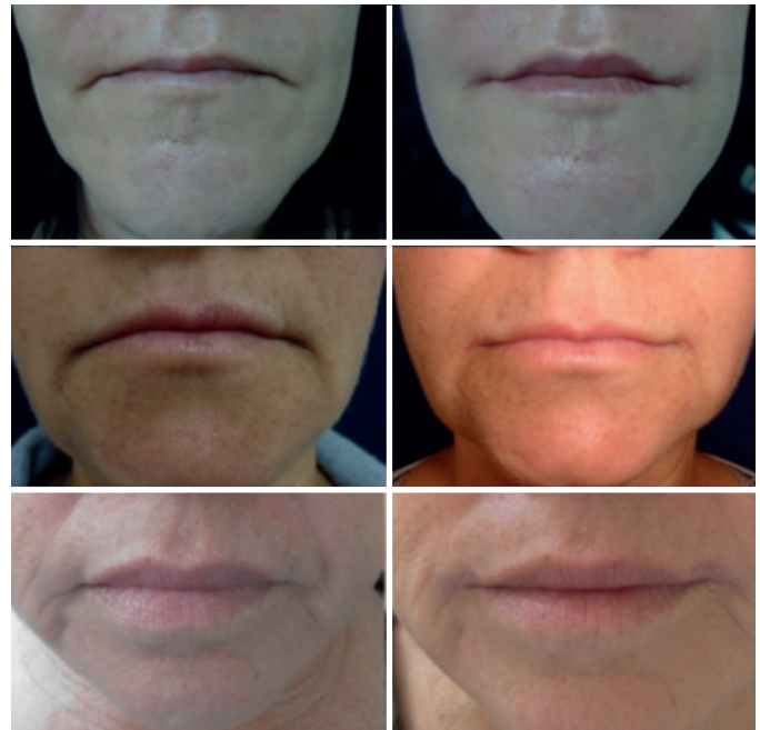
FIGURE 2: Pre-operative and 14thday post-operative, with satisfactory aesthetic results both in the physician's and the patient's evaluation

addition to the fall of the labial commissures there is a formation of marionette lines). Type I patients are treated with a triangular excision adjacent to the vermilion of the upper lip. In Type II patients, the excision is extended along the marionette lines, also with the aim of correcting them. As the patients studied did not have marked aging, the authors chose the Type I technique. 2