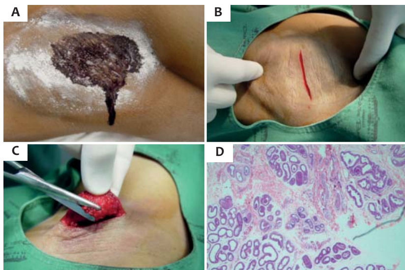
FIGURE 1: A - Intense sweating after 11 minutes into the test with iodine-starch. B - Incision of the skin in an axillary fold C - Internal shaving of the hair follicles and glandular tissue with surgical scissors under direct visualization. D - HE 40x, with the presence of eccrine and apocrine sweat glands

In axillary hyperhidrosis, 50% of the sweat is produced by apocrine glands and 50% by eccrine glands. Using the shaving technique with surgical scissors, the target is the deep dermis and the subdermis, which is the most superficial part of the subcutaneous. In this way, two types of glands are removed: the apocrine (that are located closely adjacent to the hair follicles) and the eccrine (that are partially removed, except for the complete removal of the dermis). 7