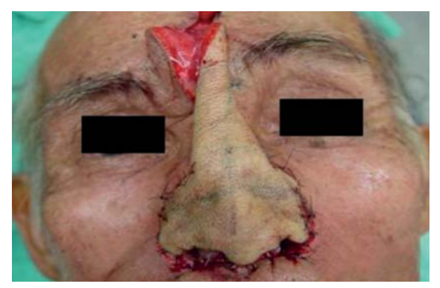
FIGURE 3: Pedicled frontal interpolated flap used for closing the surgical wound in the nose