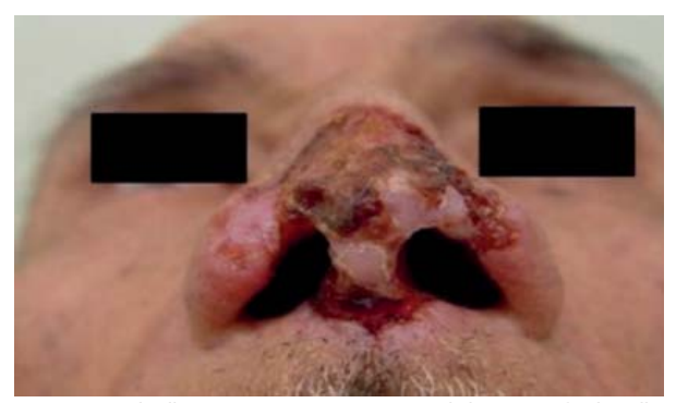
FIGURE 1: Basal cell carcinoma compromising nasal alae, tip, and columella

The cutaneous flaps used for nasal reconstruction have great versatility in their application.<sup>1</sup> Numerous techniques can be used for the closure of surgical defects caused by the excision