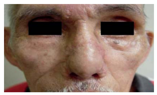
FIGURE 4: Final aesthetic result

of tumors in the nose, such as the primary synthesis, advancement flap, transposition flap, bilobed flap, grafts, or combinations of techniques.<sup>3</sup>