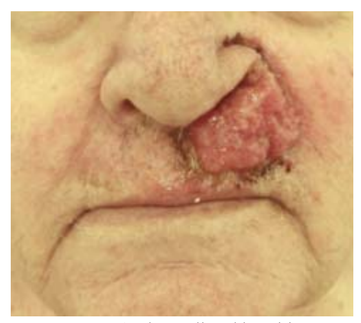
FIGURE 3: Lesions that extend beyond the nasal ala

All cases selected by the authors involve tumors of the nasal ala that were operated on at a MMS specialist center from July 2010 to April 2012.