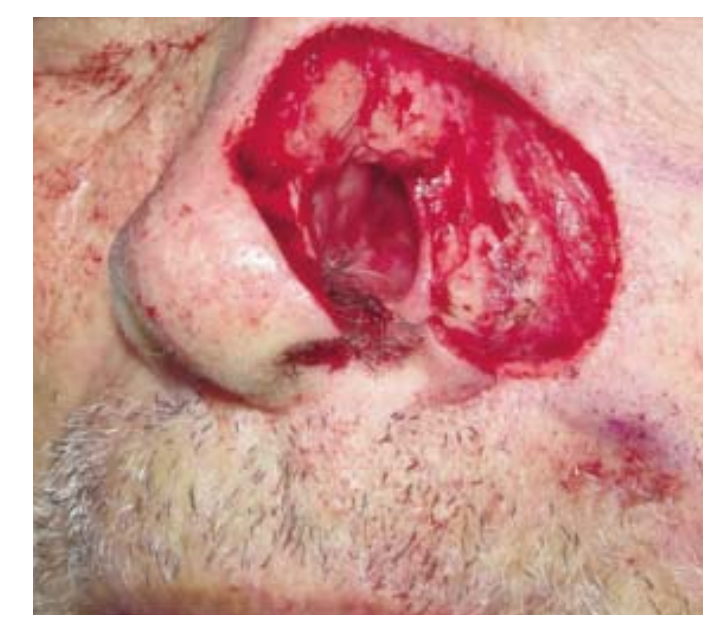
FIGURE 1: Nasal ala's full-thickness defect

The Spear's flap is prepared based on the detachment of the cutaneous flap from the nasogenian fold ipsilateral to the amputated nasal ala. A subcutaneous pedicle is left in order to take advantage of the vascularity of that region (described by Hebert<sup>8</sup>), which is supplied by the angular artery (Figure 2). The proximal third of the flap is lifted in the alar base and the proximal skin is used to reconstitute the interior area of the nasal ala, with its edges sutured to the remaining tissues of the nose. The distal 2/3 of the flap is folded over itself, reconstituting the free border and the external part of the nasal ala. Intradermal suture is carried out between the two parts of the flap, and the external part is adjusted so as to cover the entire surgical defect. The border of the flap is adjusted and sutured and the primary closure of the donor area is carried out. Nasal packing is recommended for 15 days in order to provide support for the shape of the nasal ala and prevent the retraction of the flap.<sup>8,9</sup>