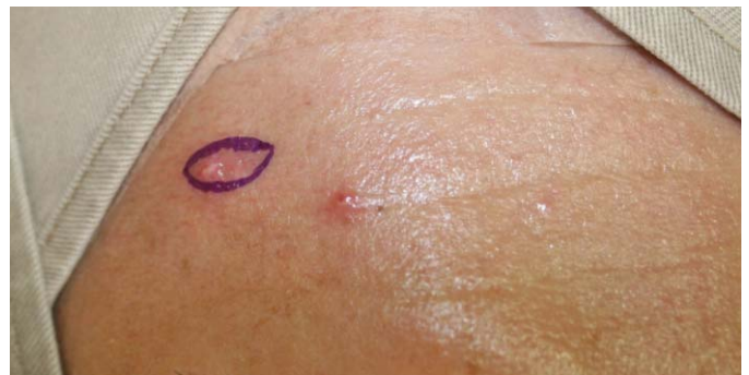
Figure 3: Pre-operative marking of the previous tumor's area (over excisional biopsy's scar). Patient with inflammatory acne lesions over scar on the surgery day