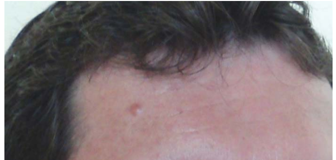
FIGURE 1: Yellowish papule 0.7cm in diameter located in the right frontal region

DFSP is a neoplasm of intermediate malignancy and low risk of metastasis. This tumor's high rate of local recurrence, in