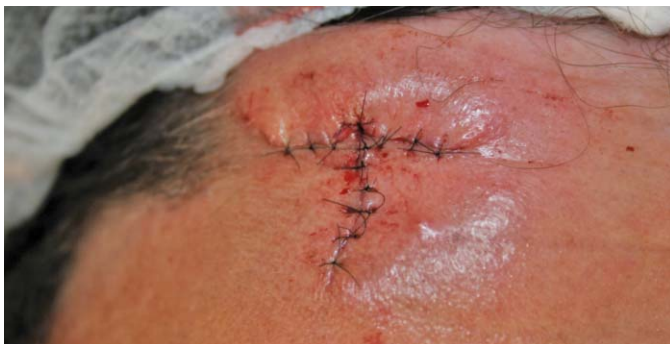
FIGURE 7: Immediately post-operative: O-T flap