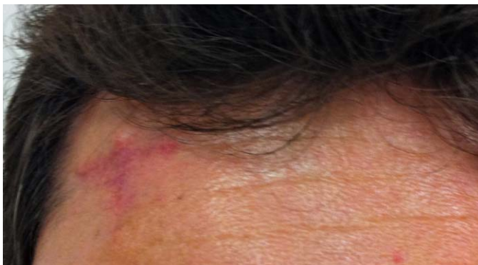
FIGURE 8: Two months after surgery: excellent aesthetic results with absence of recurrence signs

addition to high morbidity, nevertheless justifies the effort directed towards early diagnosis and the need for initial treatment that allows greater cure rates.