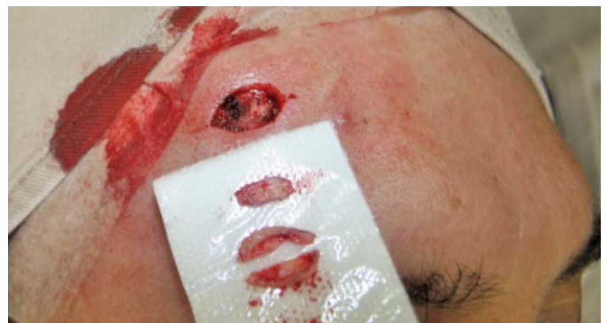
FIGURE 4: First stage: The lesion's deep and medial margins showed positivity