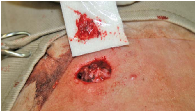
FIGURE 6: Third stage: Deep tissue was removed, including muscle tissue reaching the galea. There was no residual tumor