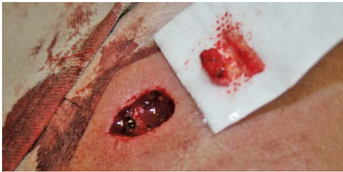
FIGURE 5: Second stage: Deep margins were compromised