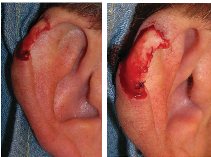
FIGURE 1: Final surgical defect