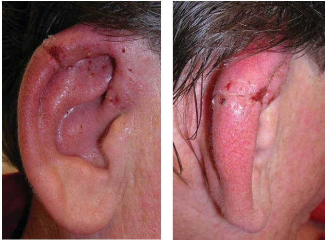
FIGURE 4: Postoperative result (after seven days)

of the area. Hence, many different techniques have been proposed to repair this region.