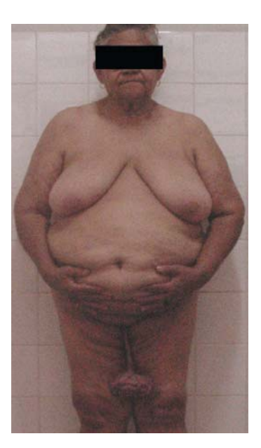
Figure 1: Massive pedunculated tumor originating in the vulva of a 73-year-old female patient

A 73-year-old mulatto female patient, who is married, reported a tumor that had been progressively developing for 20 years. Initially asymptomatic, it had progressed with discomfort in previous months, causing difficulty in walking due to the weight of the tumor. There were also areas of ulceration and bleeding. During the gynecological examination, a massive tumor with a long pedicle, torus-like contours, and an elastic consistency was revealed. The pedicle had great dimensions and was located in the upper left labium majus , extending down to the knee in its distal portion (Figure 1). The internal genitalia did not present abnormalities. The patient underwent the extirpation of the lesion (Figures 2 A, B, and C). At the macroscopic examination, the tumor presented as polypoid and had a grayish-brown color, with a firm consistency. It was 28 cm long and measured 13 cm x 10 cm in its distal portion, and weighed