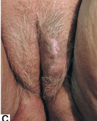
Figure 2: Photographic record of the pre-operative (A) and immediate post-operative (B) periods, and one week after surgery (C)