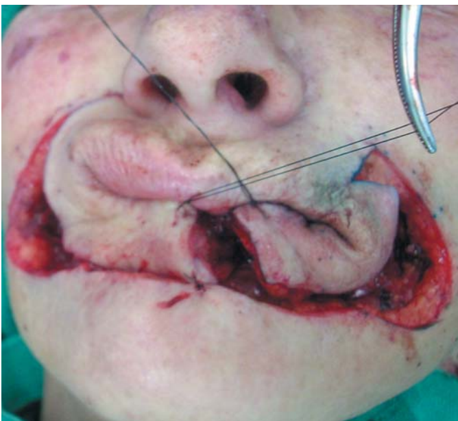
Figure 5: Left side Gilles flap

and their location), combined with adjuvant radiation and chemotherapy, depending on the clinical situation. Although its clinical benefits are not yet sufficiently confirmed, sentinel lymph node research is also recommended in high-risk tumors even if the lymph nodes are not clinically palpable. 4,5 Altinyollar and colleagues advocate the prophylactic cervical resection of cervical lymph nodes even if they are not clinically detectable, due to the high risk of metastasis. 6