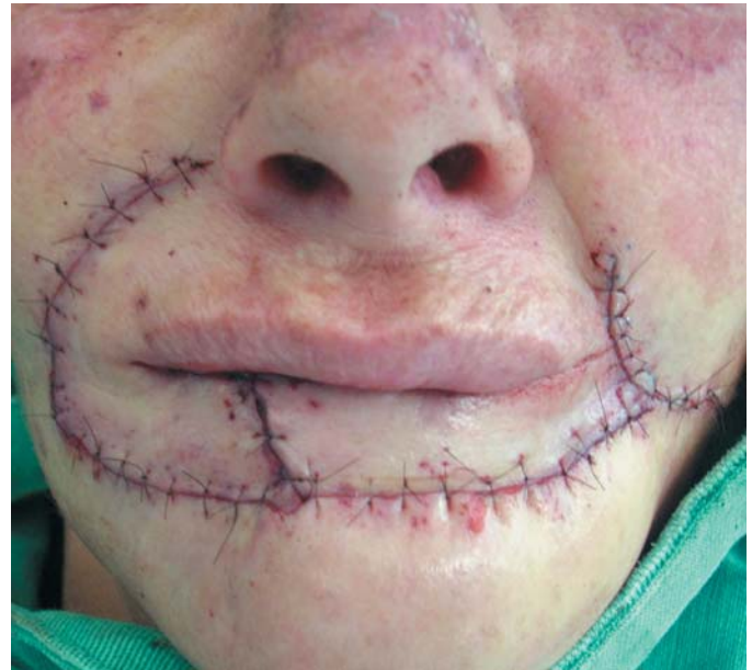
Figure 6: Appearance in the immediate post-operative period