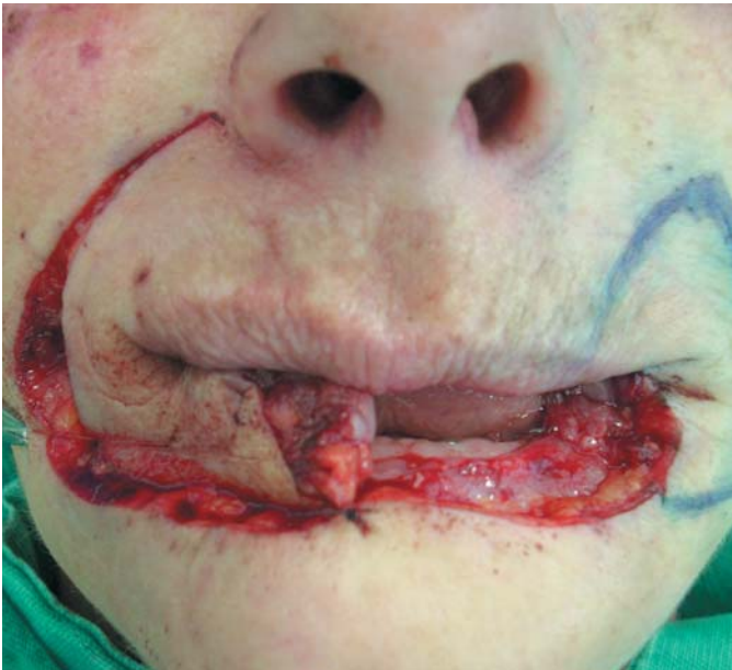
Figure 4: Right side Karapandzic flap