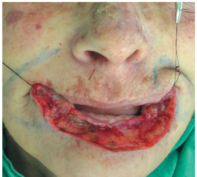
Figure 3: Tumor excision with 0.5 cm margin