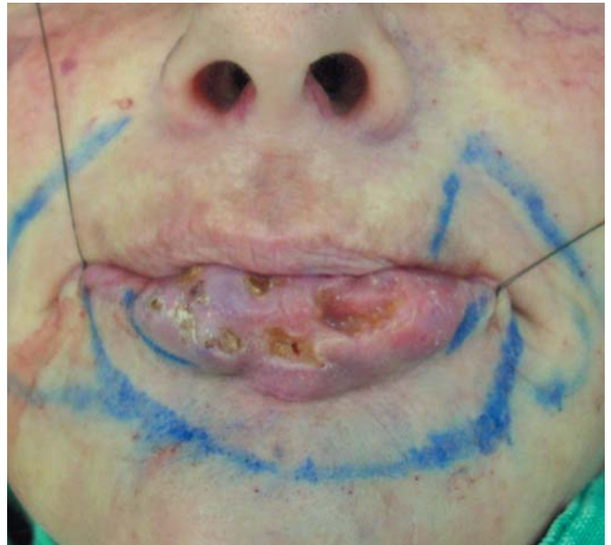
Figure 2: Schematic drawing showing flaps to be performed