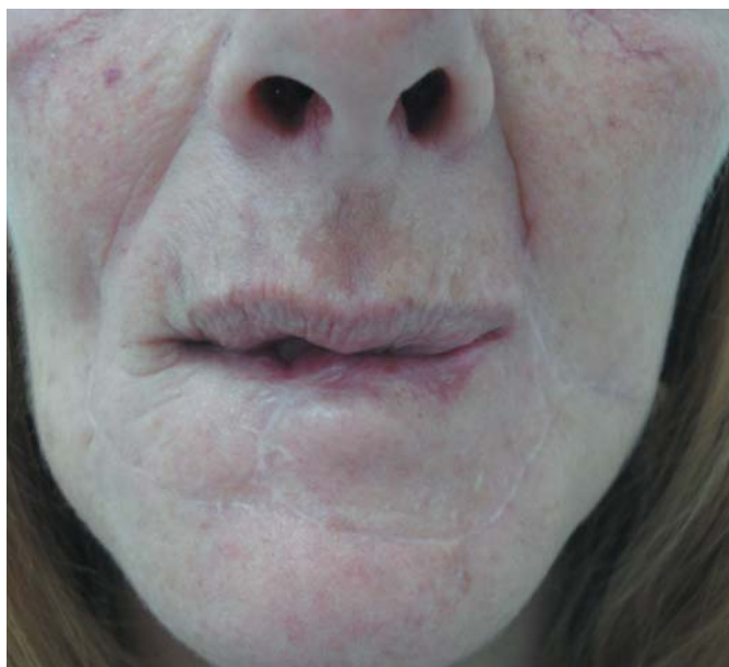
Figure 7: Second month post-operative, left side commissuroplasty

For defects affecting the full thickness of the lip, one option is the full thickness Estlander flap, involving the preparation of a triangle in the upper lip, which is transferred to reconstruct the