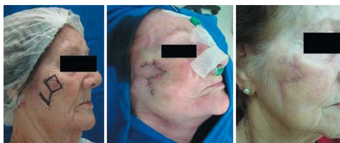
Figure 2: Pre-operative, immediate post-operative, and 30 days post-operative.