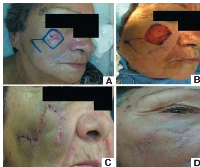
Figure 4: A: Surgical marking; B: Defect area after resection; C: 15 days post-operative after drainage of hematoma; D: Satisfactory appearance after 30 days.