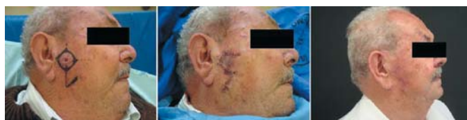
Figure 3: Pre-operative, immediate post-operative, and 30 days post-operative.