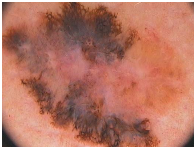
Figure 3: Dermoscopy (10X) of cutaneous melanoma showing the presence of all three features (RS, V and VS)

al streaming and pseudopods). 19 Panasiti and colleagues showed the importance of the pigment network for diagnosing benign and malignant melanocytic lesions and called the radial streaming “linear extensions.” 20 They observed that this criterion was not only strongly related to the histopathological diagnosis of melanoma but also to dysplastic nevus. 20