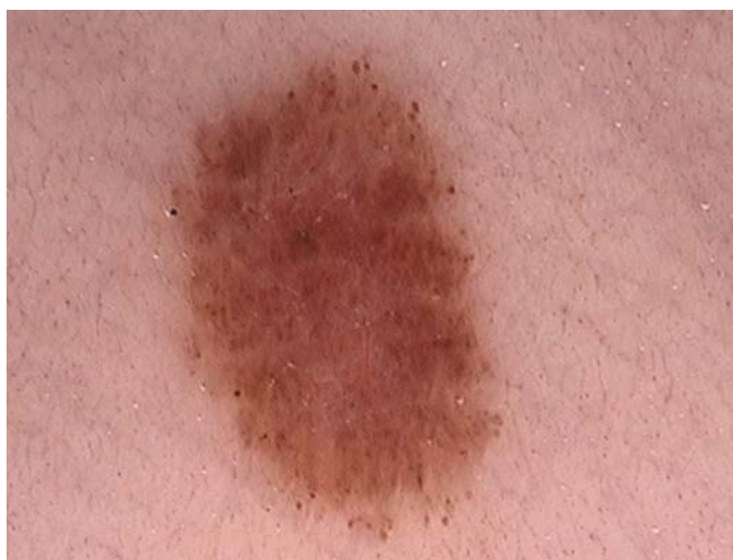
Figure 2: Dermoscopy (10X) of compound nevus showing none of the three features (RS, V and VS)

The blue hue is frequently found in melanoma lesions and is characterized dermoscopically as a blue-white veil (an irregular, structureless area of confluent blue pigmentation with an overlying white “ground-glass” film) and blue areas (diffuse