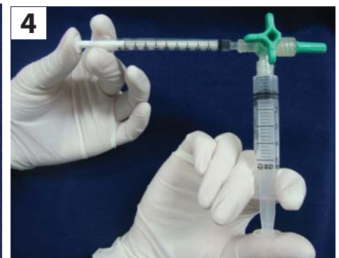
Figure 4: Alternate compressions on the syringes' plungers