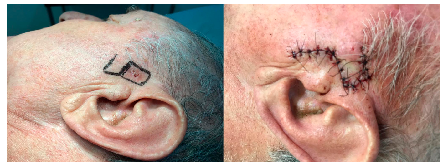
FIGURE 2: Immediate pre and post-operative

Local flaps are an excellent option for the excision repair of tumor skin lesions, where primary closure of the defect would cause aesthetic and/or functional damage, with the possibility of distortion of the structures. They are preferred to grafts as they present better color and texture correspondence with the recipient skin area since they are in the same region. Also, they don't need a homogeneous receptor bed for good integration since