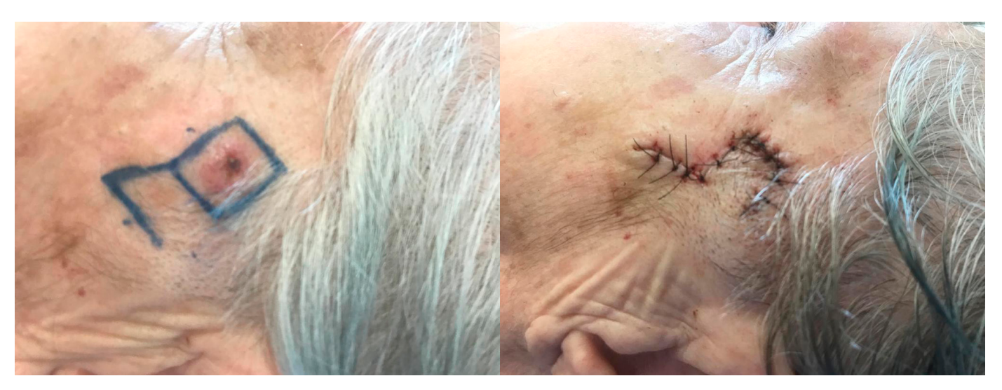
FIGURE 3: Immediate pre and post operative