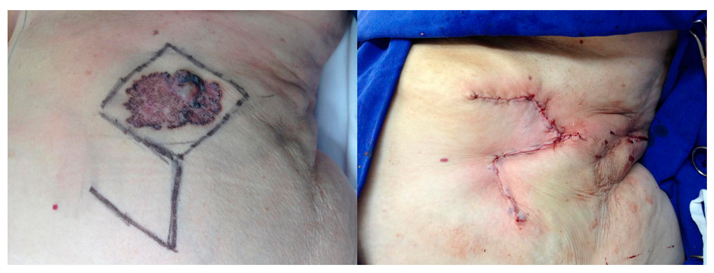
Figure 6: Immediate pre and post-operative