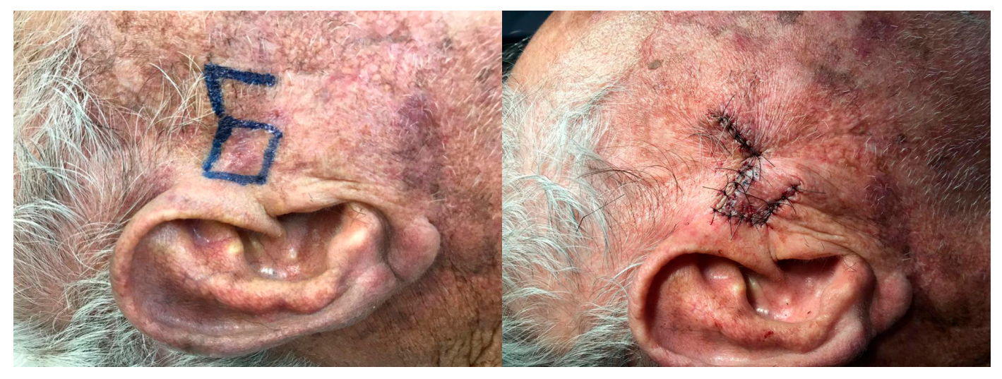
FIGURE 4: Immediate pre and post-operative