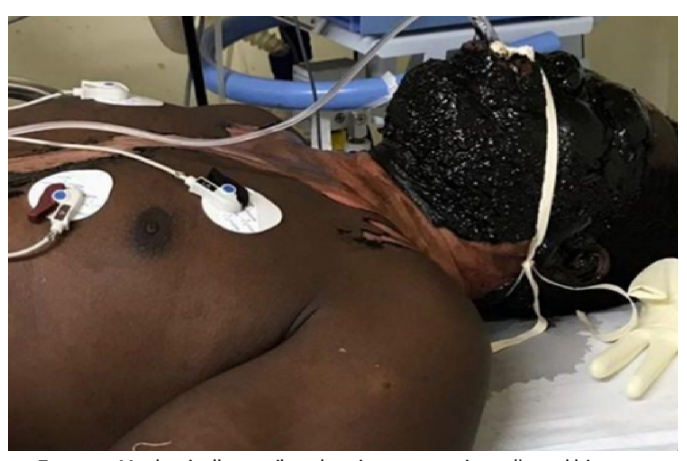
FIGURE 1: Mechanically ventilated patient presenting adhered bitumen plaque across the face and skin detachment in the cervical and thoracic region

The patient evolved with the need for orotracheal intubation, sedation, analgesia, mechanical ventilation, parenteral hydration, according to the Parkland formula, and was referred to the intensive care unit (ICU). He presented a significant improvement in respiratory condition with progression of ventila-