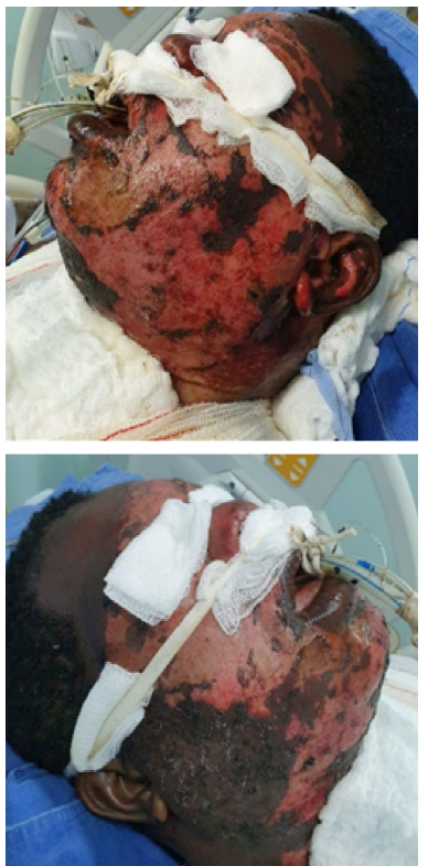
FIGURE 2: Patient on the 4th day of hospitalization with first and second degree burns on the face after removing the bitumen with liquid vaseline