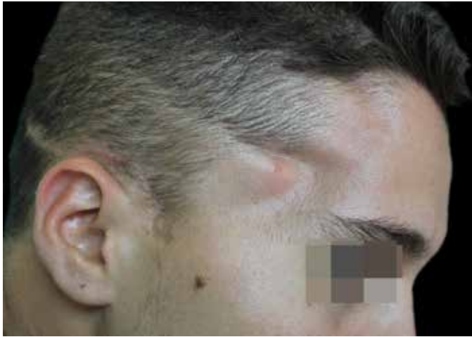
FIGURE 1: Right frontal deformity