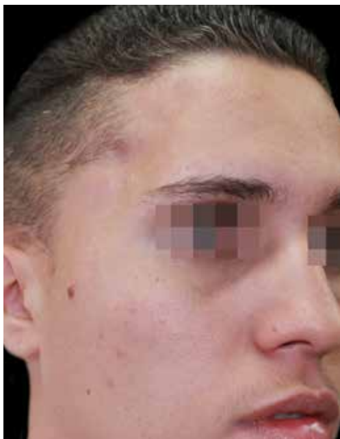
FIGURE 5: Six months after the first intervention

The correction of facial deformities, whatever their etiology, is still a significant challenge for the dermatological surgeon. In more straightforward cases, such as post-traumatic