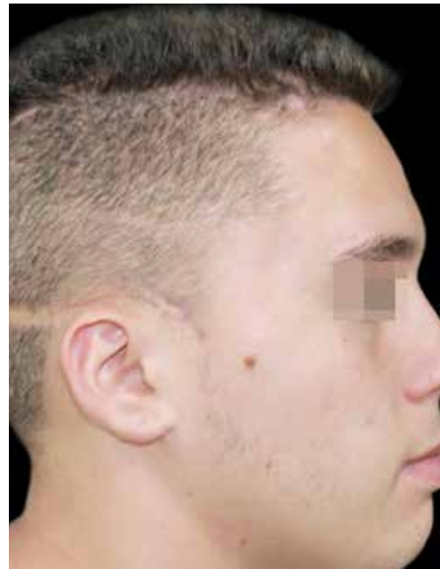
FIGURE 6: Nine months after the second intervention

chin deformities, botulinum toxin can be used. 1 However, for lipodystrophy or depressed facial scars, autologous fat grafting (AFT), hyaluronic acid, or poly-L-lactic acid are recommended. 2 For cases of cartilage and bone loss, acrylic resin prostheses can be used. 3