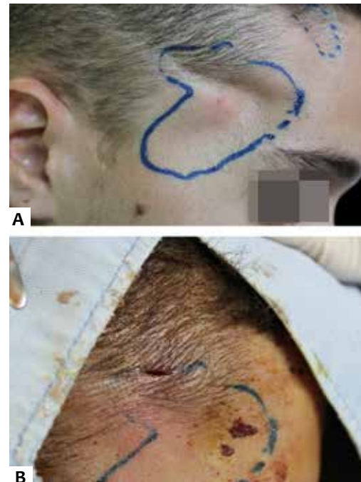
FIGURE 3: A - Marking the area to be filled. B. Incision with blade size 15 and local detachment using tentacle