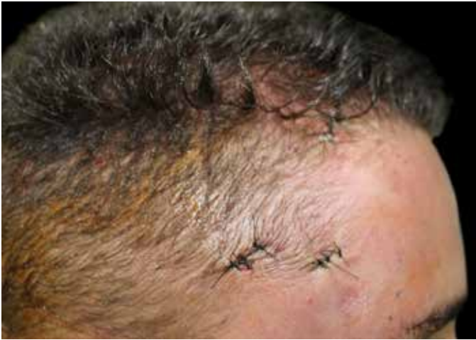
FIGURE 4: Immediate postoperative