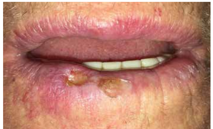
FIGURE 3: Ulceration and necrosis after 2 weeks of superficial intralesional infiltration of OE5% 0.1 ml in 2 lesions on the lower lip

The treatment modalities for venous lake include electrocoagulation, surgical excision, laser therapy, infrared coagulation, cryotherapy, and sclerotherapy. 5-8 OE5% is one of the most widely used sclerosing agents in treating vascular lesions. The literature describes it as a safe and effective method for injuries located in different body regions. 7-10