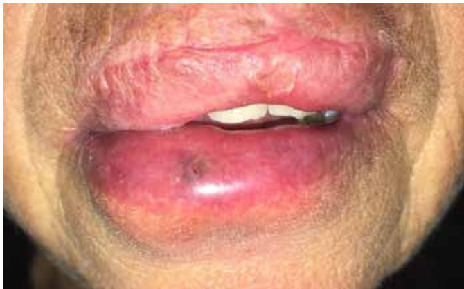
FIGURE 2: Edema after 5 minutes of infiltration of 0.1 ml of OE5%. The patient reported feeling a slight burning sensation

LL = lower lip; UP = upper lip; OM = oral mucosa