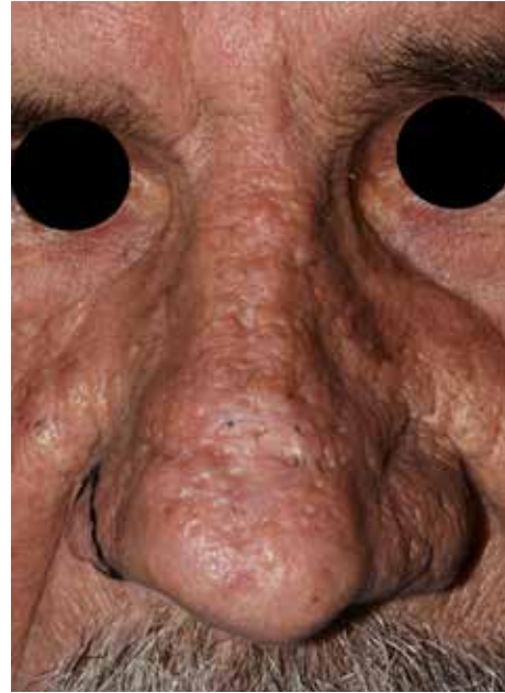
FIGURE 5: Result after 36 months of primary synthesis

good aesthetic result for the patient and, most importantly, providing a fast recovery. 5