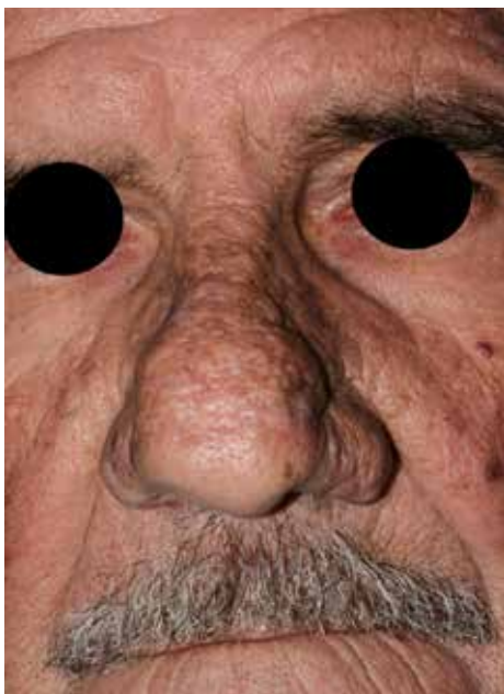
FIGURE 1: 68-year-old men with overall nose enlargement

A 68-year-old man presented progressive nasal enlargement with an irregular surface, enlarged pores, and telangiectasia (Figure 1). He reported aesthetic discomfort and social damage. We then opted for surgical treatment. As he presented several comorbidities, such as heart transplantation using immunosuppressants and antiplatelet agents, abdominal aortic aneurysm, and arterial hypertension, it was necessary to choose a quick surgical approach, with little bleeding and with a lower risk of complications. A vertical incision excised the excised skin at the nasal tip and dorsum and a horizontal cut in the alar sulcus, in a cross-shape, to reduce the hypertrophic tissue and the nose (Figures 2 to 4). It was followed by primary closure of the lesion, initially with internal suture approaching the surgical wound's edges and, after, external suture. There were no immediate complications or recurrence of the condition during the 36-month follow-up (Figure 5).