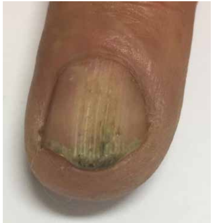
FIGURE 3: Subungual hyperkeratosis and longitudinal hypercurvature of the nail plate of the third right finger are observed

Nail mycosis is an extremely relevant point when addressing the onychomatricoma theme. Onychomycosis is reported from different perspectives: as a pathology caused by the tumor; as a precursor agent; as a disturbing factor for diagnosis; and, also, a complicating factor of the neoplasia.