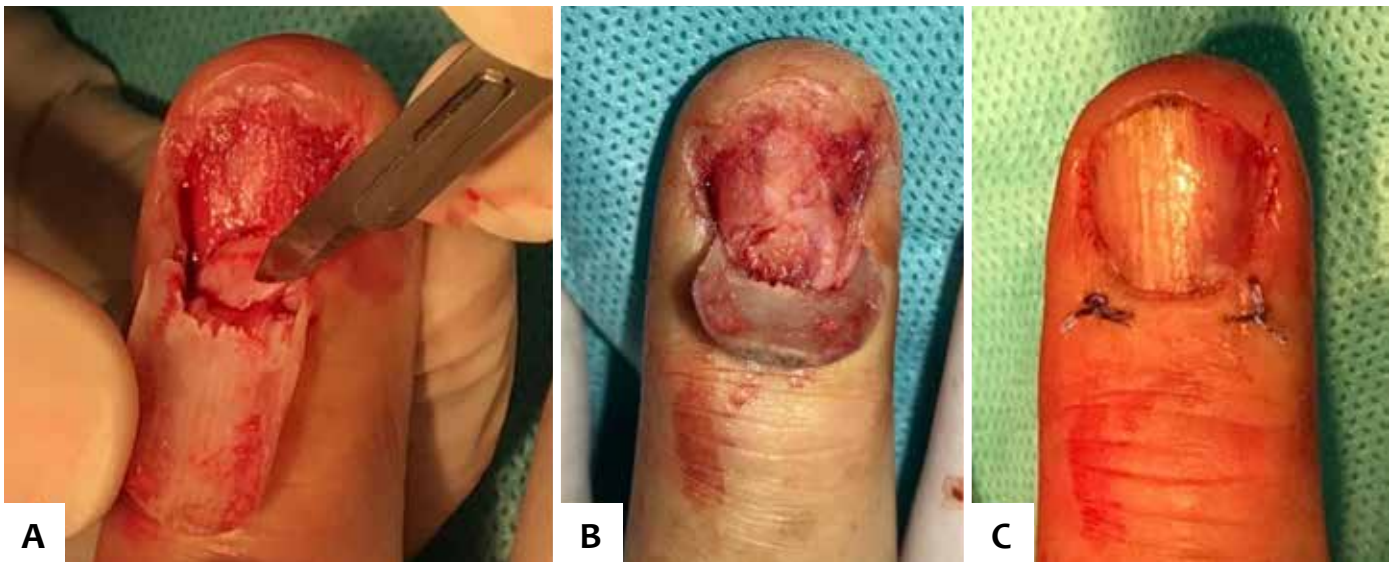
FIGURE 5: Excisional biopsy of the third right finger: A) removal of the onychomatricoma, B) visualization of the intraoperative tumor, C) closure after surgical procedure

even due to small and repeated bruises, as in the case of a tool-maker. 3 Such information allows us to conclude that the type of trauma is separated from the tumor's occurrence and that the profession can be considered a risk factor.