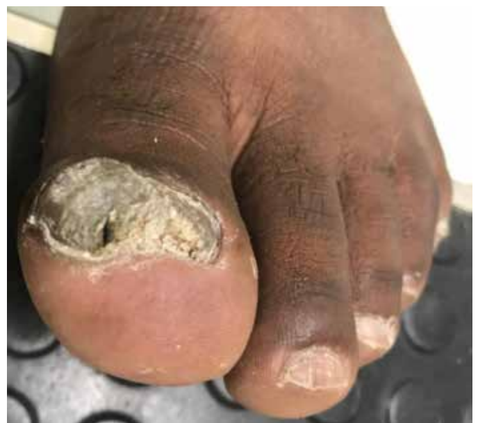
FIGURE 1: Onychodystrophy of the left hallux

Dermoscopy observed the presence of xanthonychia, splinter hemorrhages, subungual hyperkeratosis, and longitudinal hypercurvature on the nail plate (Figure 3), suggesting the clinical and dermoscopic diagnosis of onychomatricoma (Figure