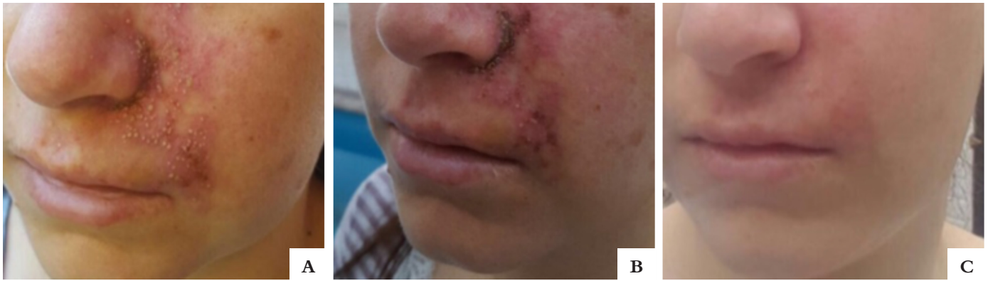
FIGURE 4: Case 4 (A). Pustular eruption along the left nasolabial folds (4 days post-injection) (B). Erosions with crusting (7 days post-injection) (C). Full recovery with minimal post inflammatory hyperpigmentation

While increasing pain and cutaneous discoloration are well known clinical signs, the pustular rash is a less well-recognized manifestation of vascular obstruction. As a result, misdiagnosis of pustular rash as herpes simplex infection delays proper management. The mechanism of pustular rash is potentially related to polymorphonuclear cell attraction to the site via complement activation during ischemic or thrombotic events, as reported in other tissues. 17-19