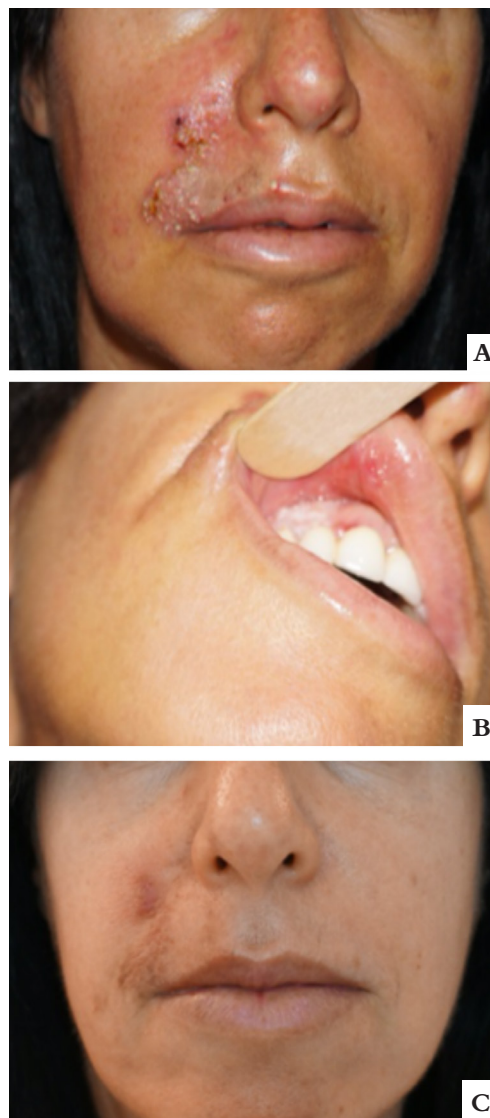
FIGURE 1: Case 1 (A). Pustular eruption along the right nasolabial folds and upper lip (5 days post-injection) (B). Erosions on the mucosal side of the left lip (5 days post-injection) (C). Full recovery with minimal post-inflammatory

A 32-year-old woman was injected elsewhere with HA-based filler for nose enhancement. Twenty-four hours after the injection, the patient experienced severe pain accompanied by skin discoloration. The treating physician's office staff dismissed these complaints as a normal post-procedural effect. On the third day after the injection, the patient was seen in a hospital emergency room with a pustular eruption, and we were tele-con-