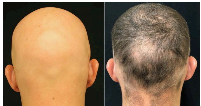
FIGURE 2: Alopecia areata unresponsive to JAK inhibitor monotherapy. Left: After 6 months of ruxolitinib 25 mg twice daily, Severity of Alopecia Tool (SALT) score was 100% (same as prior to starting ruxolitinib). Right: Nine months after starting adjuvant oral minoxidil (AOM), SALT score was 23%.

In some patients who are refractory to JAKi monotherapy, AOM may offer a solution. In our experience, the response to adjuvant treatment is typically seen 3–6 months after initiation of