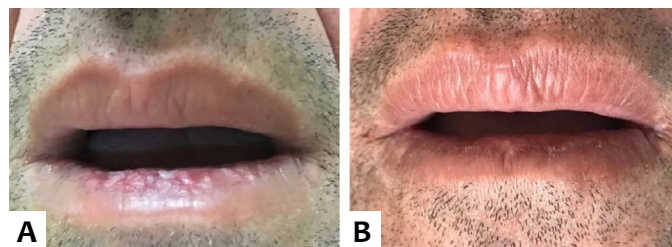
FIGURE 1: Actinic cheilitis on the lower lip. A. Before (left) and after, B. (right) 3 months from the last DL-PDT session