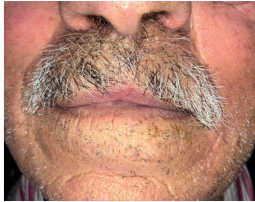
FIGURE 2: Case 2 - SCC in the upper lip. Uni-lateral inverted Yu's flap