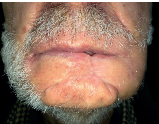
FIGURE 3: Case 3 - SCC in the lower lip. Bilateral Yu's flap

The Yu's flap is a good option when the surgical defect covers more than 1/3 of the lip's length. Thus, when applied unilaterally, it can cover defects of up to 2/3 of the lip's extension. If performed bilaterally, it is able to repair defects covering 2/3 of the lip's length or even subtotal defects. 2,3