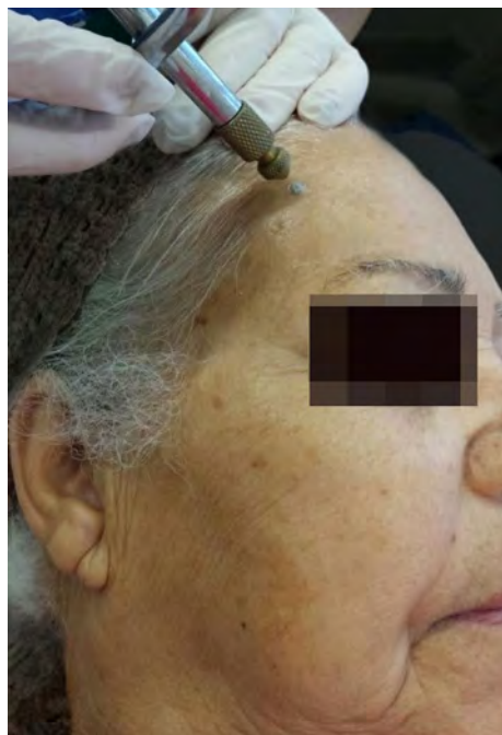
FIGURE 1: Spraying of liquid nitrogen on the lesion

2) Spraying of liquid nitrogen over the lesion from a distance of 2.5 to 3.8cm, for 4 to 5 seconds, up until the complete freezing of the lesion, visually verified based on the whitening of the region (Figure 1). 2