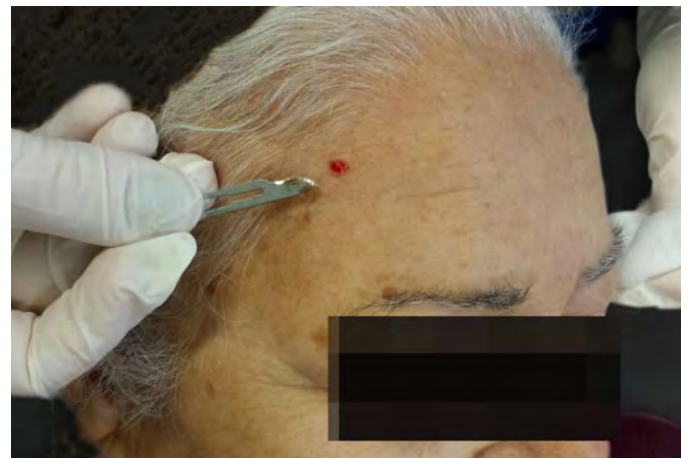
FIGURE 3: Complete excision of the lesion

The procedure is indicated for benign, pre-malignant lesions and non-melanoma skin cancers. Thus, the technique can