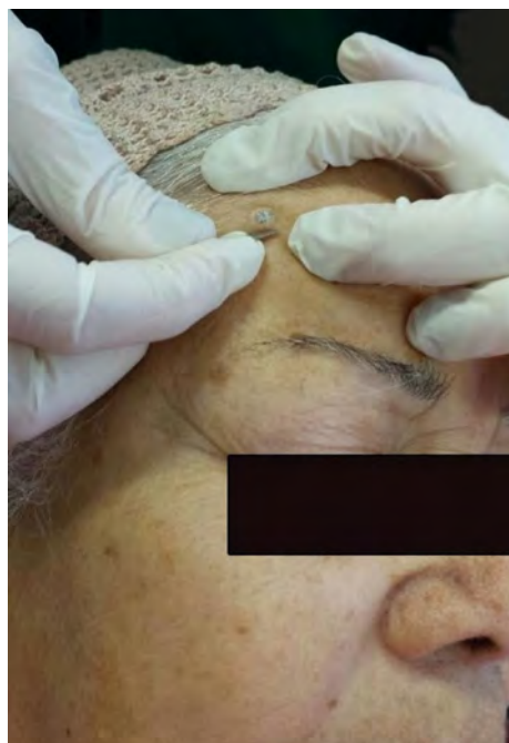
FIGURE 2: Shaving at the base of the lesion

3) Shaving at the base of the lesion, using a scalpel with n.15 blade, as soon as the thawing of the skin begins, while the tissue still offers some resistance (Figures 2 and 3). 2