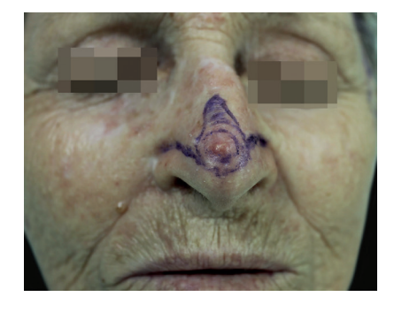
FIGURE 1: Marking of lesion with safety margins of 3mm and drawing of the A-T flap