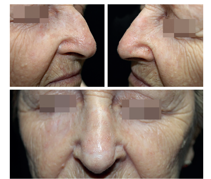
FIGURE 4: Appearance of the A-T flap in the nasal tip 6 months after