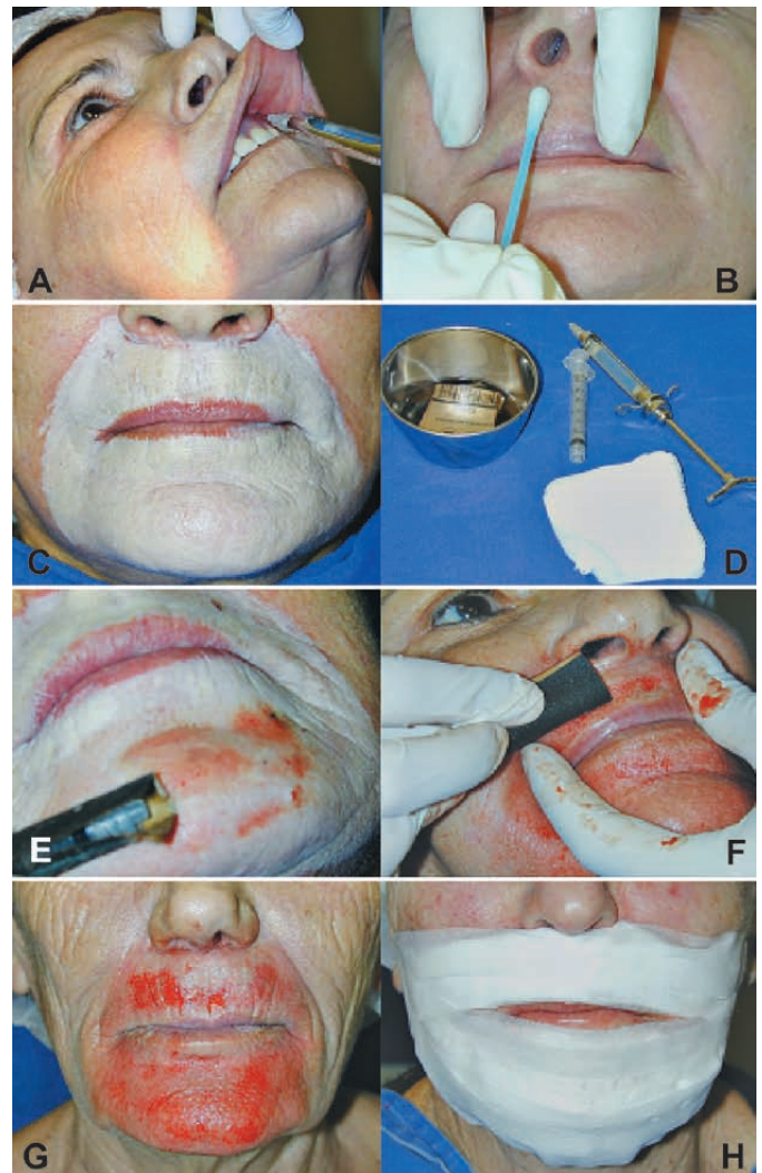
Figure 1. Chemabrasion technique for perioral wrinkles. A) Anesthesia; B) Application of TCA 35%; C) White solid level 3; D) Material; E) and F) Dermabrasion with sandpaper number 220; G) Final phase of dermabrasion; H) Dressing.

In this study, the TCA 35% was applied before manual dermabrasion with water sandpaper, since queratocoagulation caused by the acid makes the skin friable and defines the depth to be achieved, facilitating the dermasanding. The procedure also becomes more predictable with its use, eliminating variables that are interfering with the depth of dermabrasion, such as the skin thickness. 19