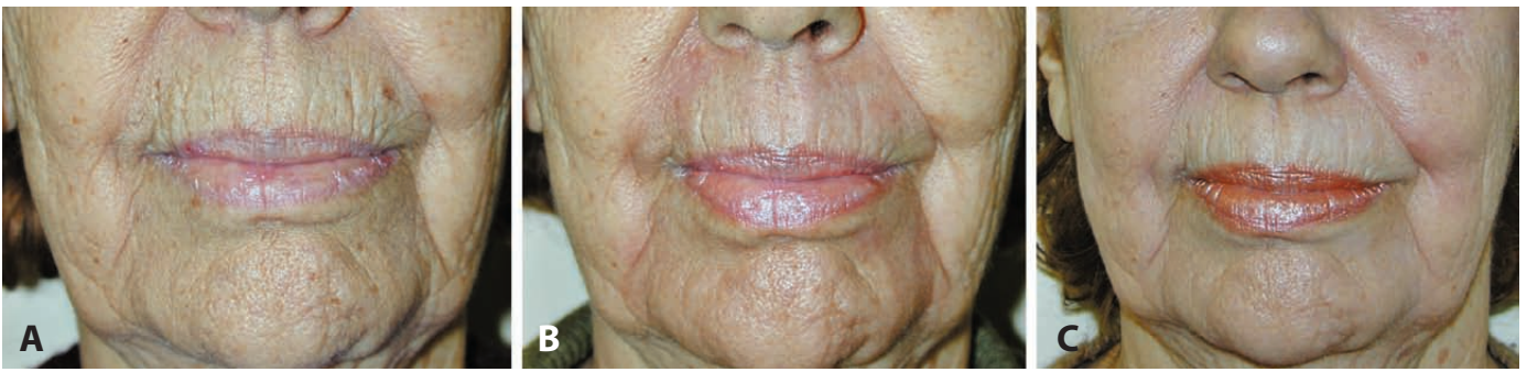
Figure 2. Patient who was submitted to chemabrasion of perioral wrinkles. A) Before; B) After 30 days; C) After 12 months