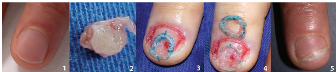
Figure 1. 1) Before surgery; 2) Surgical piece; 3) Margin establishment; 4) Margin submitted to freezing; 5) Final result.

The glomus tumor is an uncommon injury with higher incidence in females, usually in the subungual location. In